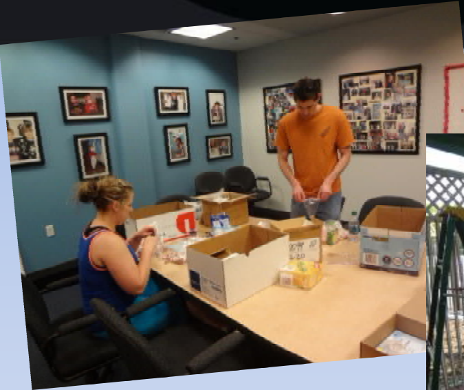
ELE'S PLACE Lansing, Michigan